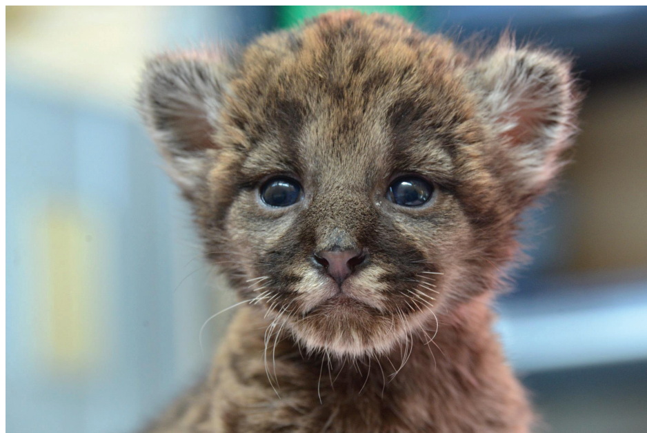
Panther pets will now be allowed to accompany owners in resident halls.

new initiative has been largely favorable, as residents cannot wait to bring their pets to school next semester, though many are content just to be sharing their buildings with so many doubtlessly adorable animals. "This is the best thing that has ever