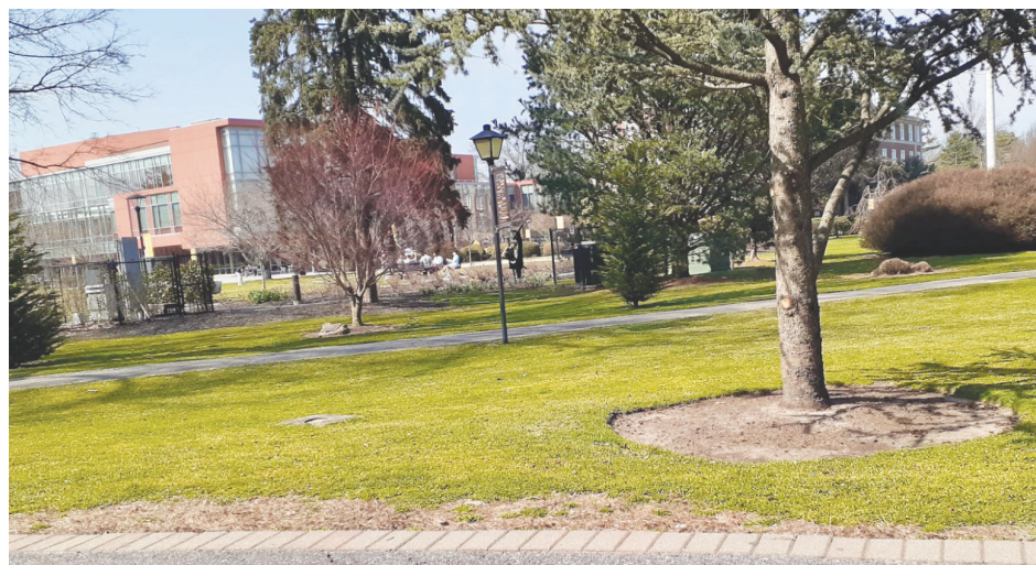
Adelphi's Garden City campus, recently deemed worthy of a $52,110 experience.

The modernization initiative is projected to be completed as soon as you graduate. 🐾