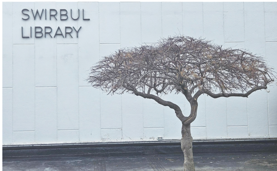
One of the last photos of the "Swirbul Library" signs ever taken before the announcement.

Some are sad to see one of the most beloved buildings on campus go away, but the Adelphi community has until the end of the semester to bid the library goodbye. 🐾