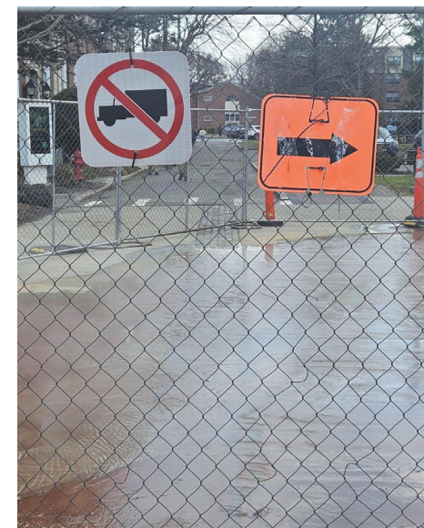
Future site of a new Adelphi canal already under construction.

When asked about how the gondola system is going to work, Canali described it as a "fixed schedule" similar to a bus or train. Passengers can get off at certain stops, or if the canal itself is too narrow, they can safely get off at any time. They have to get on only at the canal stops, not anywhere else.