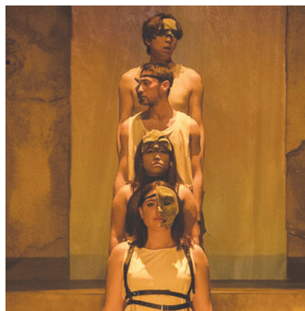
One of the College of Arts and Science programs that's being shut down.

To stay as one of the best colleges on "U.S News and World Report," and so many other dubious school rankings, Adelphi plans to remodel the College of Arts and Sciences curriculum to reflect